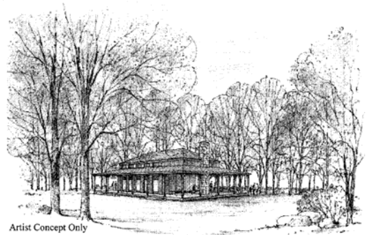
Artist Concept Only

Koinonia has extended our bidding time schedule beyond our original deadline. As a result ground breaking may be delayed. Fortunately there will be no interruption in Conference Center use while construction is in progress.